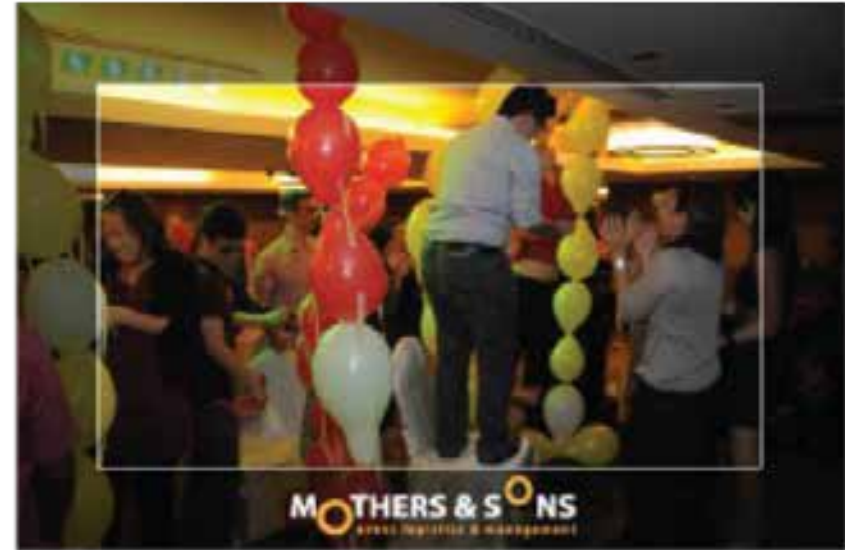
Corporate Dinner and Dance for BYME Engineering