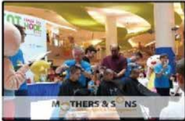
Hair For Hope 2013 - Vivacity