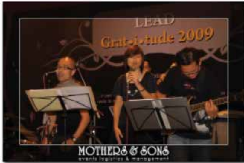
Appreciation Night for LEAD (Marshall Cavendish)