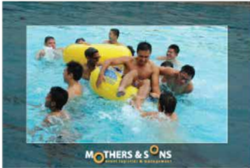
Team Building Programme for Mindef SAF